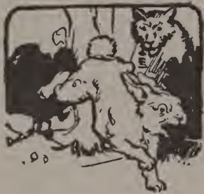
Off Tore Br'er Rabbit at Full Speed.

“TELL you a story, children? Well, let me see.” Daddy meditated a long time, for he was very tired after a hard day’s work. Suddenly he said: “Suppose I tell you about Topsy?”